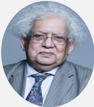
Lord Meghnad Desai

Member-British House of Lords Emeritus Professor of Economics, London School of Economics